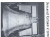
Immanuel Lutheran Church